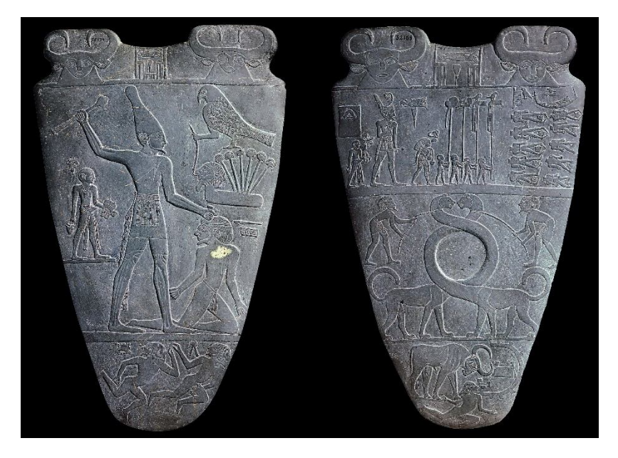
Figure (2) Both sides of The Narmer Palette

2.A superb gold falcon head of the god Horus (Radwan,2004:p.164).