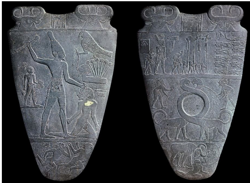
Figure (2) Both sides of The Narmer Palette

2.A superb gold falcon head of the god Horus (Radwan,2004:p.164).