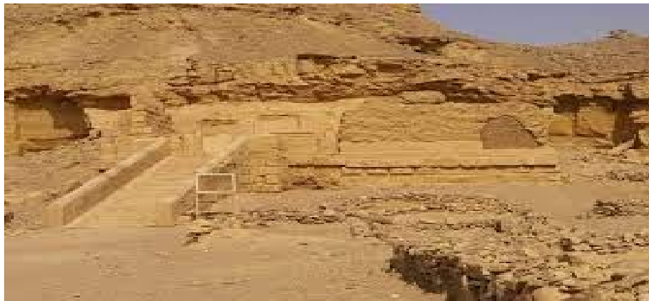
Figure( 3) The rocky site of El Kab

5.webshots page ( http://community.webshots.com )