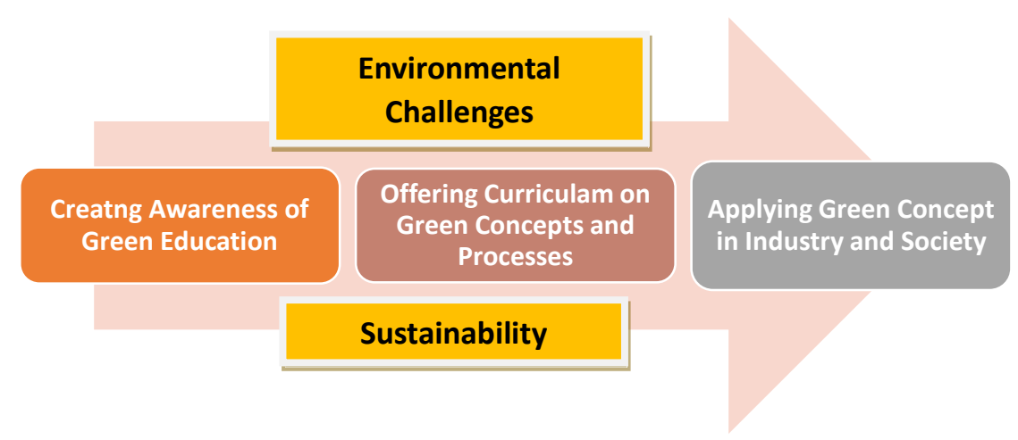
Figure no. (1) Green Model in Higher Education

According to the green education paradigm, knowledge enables students to address and identify solutions to issues that endanger sustainability (Rao & Aithal, 2019).