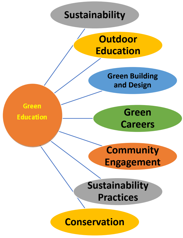
Figure no. (2) Green Education Components