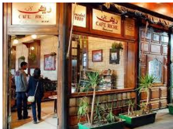
Plate (1) At the top of the gate, we see a glass sign showing the name of the café in Arabic (مقهى ريش) and in French (Café Riche), Then the date 1908 refers to the date of the establishment of the café, which is written in Arabic and English