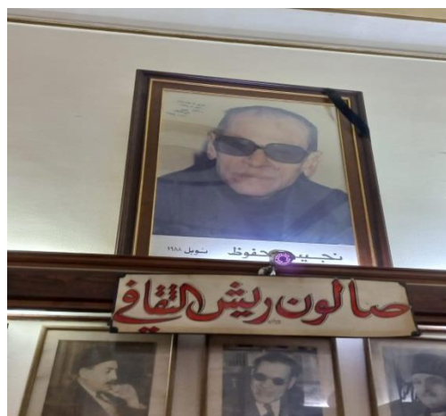
Plate (11) The picture of the writer Naguib Mahfouz has his signature