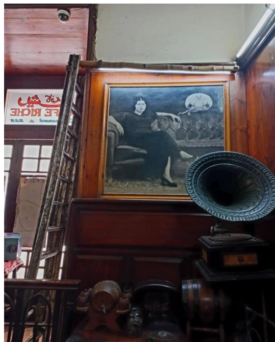
Plate (7) a large photographic picture (Zencograph) of Umm Kulthum