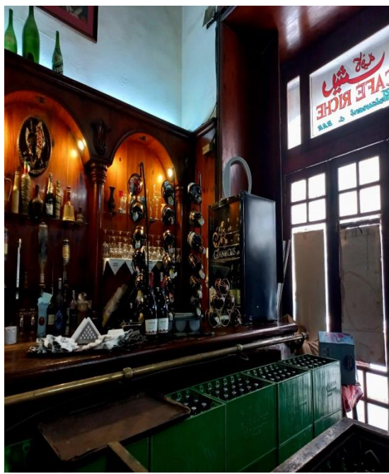
Plate (6) The Bar