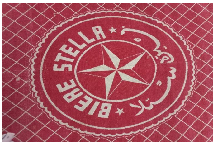
Plate (3) The promotional campaign for "Stella" drinks and usually had the famous drink star in the middle.

Plate (2) The First (External Hall) the main hall of the café, and it consists of a rectangular hall with tables surrounded by four or six wooden chairs