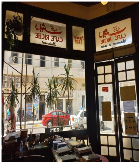
Plate (4) On the right of the entrance, there is an office of the owner