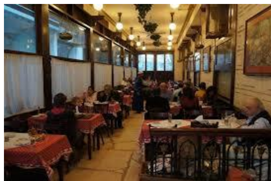
Plate (2) The First (External Hall) the main hall of the café, and it consists of a rectangular hall with tables surrounded by four or six wooden chairs