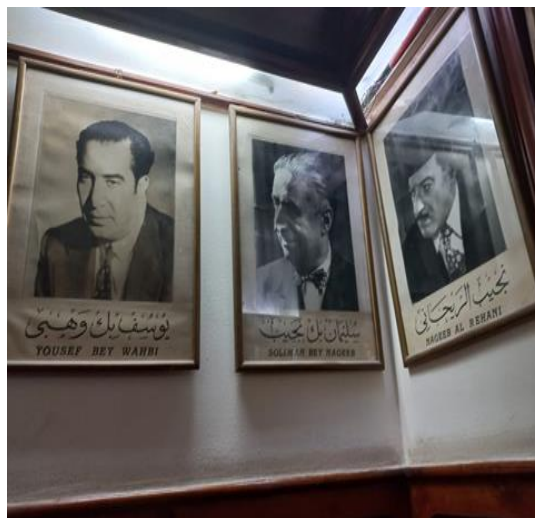
Plate (10) photographs of Egypt's prominent novelists, journalists, actors and poets, literary