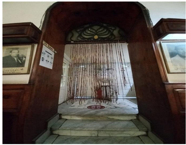
Plate (13) The Toilet of the Cafe