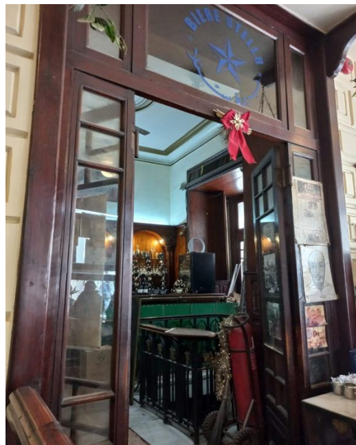
Plate (5) The door beside the office leads to the basement and the bar