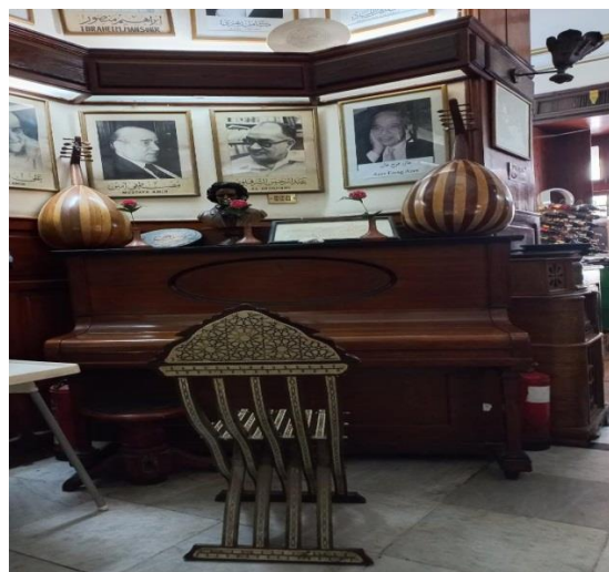
Plate (12) Two pianos