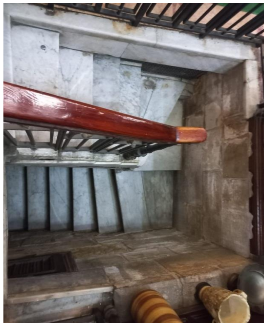
Plate (8) The Basement